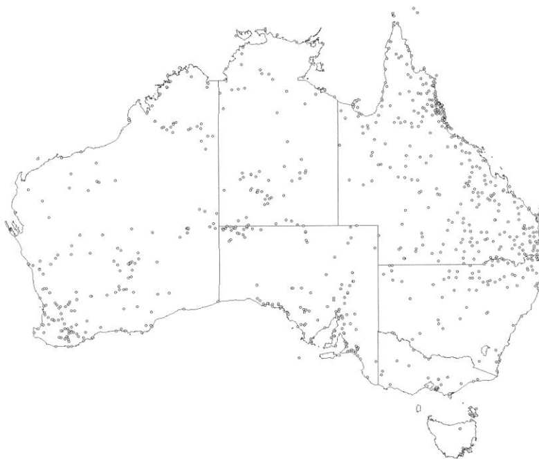
Figure 1 Map showing the birthplaces of individuals in the curated samples