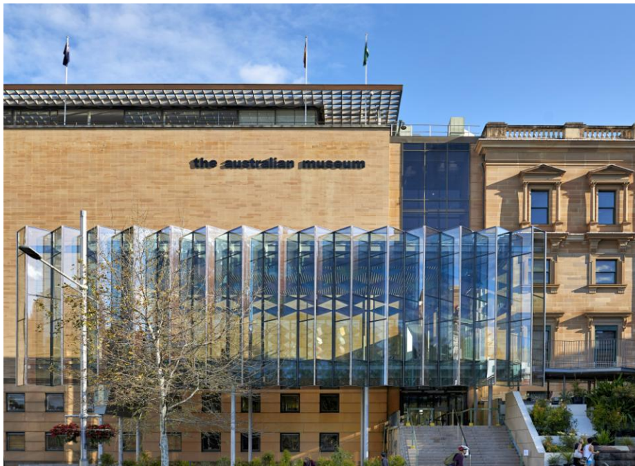
Crystal Hall – view from William St