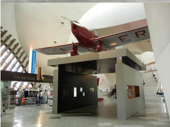
Percival Type D3 Gull Six monoplane, 1936-37